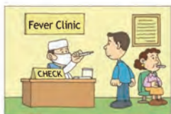
inspection and diagnosis

China has established a relatively complete response system to prevent an outbreak of infectious diseases.