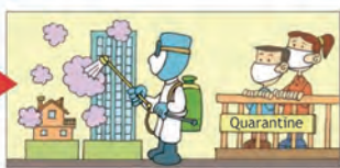
disinfection and medical observation