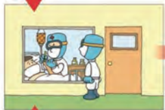
isolation and treatment