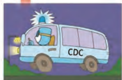
transport confirmed cases