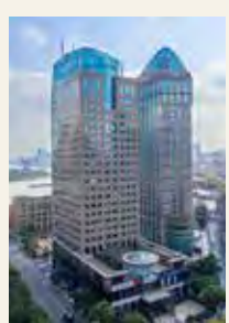
Shanghai Bund International Tower, where World Scientific owns and occupies unit 2003.

Located in the Shanghai Bund area, our Shanghai office has enabled us to serve the vast China market, especially in bigger cities like Beijing, Shanghai, Guangzhou, and other developed regions along the east coast, since the mid-90s. Together with our Beijing Office, the Shanghai Office provides a comprehensive range of services to booksellers and libraries and is committed to serve its authors and customers across China.