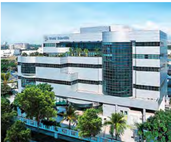
World Scientific's Headquarters in Singapore.

World Scientific publishes approximately 600 new titles and 140 journals covering various fields a year. Many of its books are recommended texts adopted by renowned institutions such as Harvard University, California Institute of Technology, Stanford University and Princeton University. The Group has also expanded into other business areas, including prepress services, digitalisation, graphic design, printing, translation, and event management.