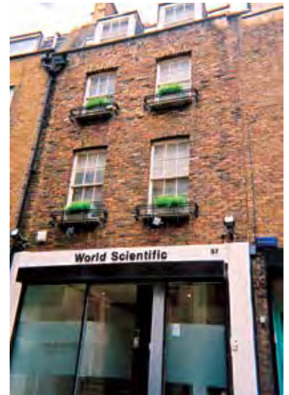
Façade of World Scientific-owned Covent Garden, London office.