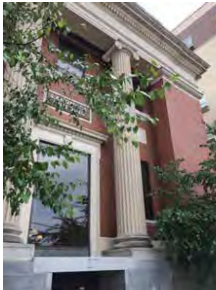
Landmark Building in New Jersey, where World Scientific operates from Suites 401–402.

Starting out with only five employees in a tiny office, the company presently employs 200 staff in its headquarters in Singapore and has a global headcount of 450. Other than the initial offices in New Jersey, London, Hong Kong, Taipei, Beijing, Shanghai and Chennai, the company has expanded its network to include Munich, Geneva, Tel Aviv, Tokyo, Tianjin, among others.